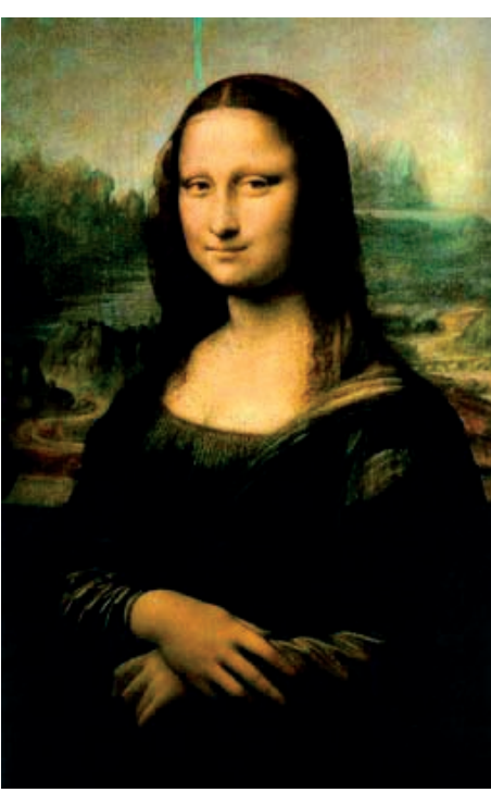
Fig. 4, Leonardo da Vinci, Mona Lisa, c. 1505, Louvre, Paris

This was a veritable revolution for LEONARDO's peers, whose works to this point, especially portraiture, included status-indicating details and were rendered in harsh, outlined style with jarring tonal differences between colors.